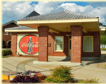
Heard County Historic Gas Station, Franklin, GA